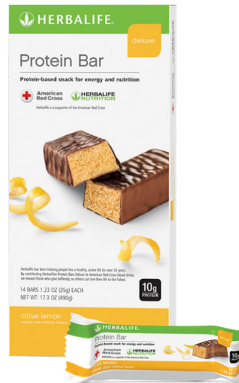
PROTEIN BAR Snacks