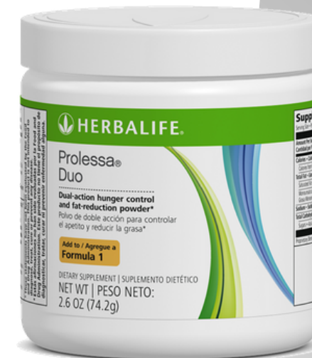
PROLESSA Fat Burner

*These are not included with your program but you are able to get them separately through our website* ONLY AVAILABLE IN SOME COUNTRIES